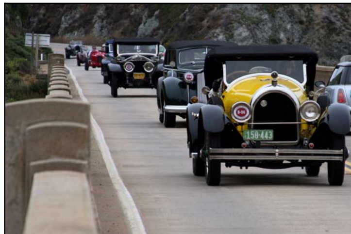
Bugsby crossing the Rocky Creek Bridge on Highway 1 during the 2010 Pebble Beach Tour d'Elegance. (Steve Sweetman)

Cost new.....$2185 f.o.b. Hartford, Wis.