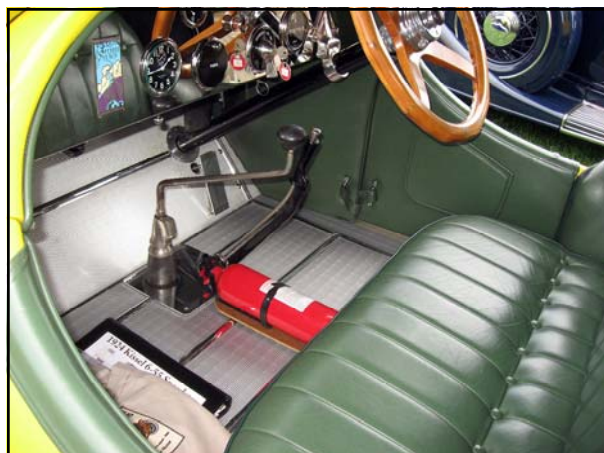
A view of Bugsby's interior shows the intimate seating for two. Flaps cover small storage compartments in each door and there is room under the seat for papers and some tools.