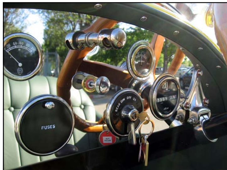
The back of his green leather seat is reflected in Bugsby's polished metal instrument panel. Shown (left-to-right) are oil pressure gauge, fuse box, ignition/light switch, ammeter and speedometer/odometer. Not shown is the 8-day black-face Waltham car clock located off of the left side of the photo. One of the three fuses housed under the fuse-box cover is a spare. The red tag on the keychain reminds Lynn to shut off the fuel when he's done motoring. (Lynn Kissel)