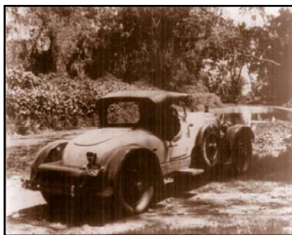
When he was new, this image of Bugsby was captured in 1925 at Fairy Bower, Gracemere, a popular picnic location outside of Rockhampton, Australia. A large folding flap on the back of the top has been opened for increased ventilation on a warm summer day.

Styling elements of the Kissel Silver Specials were a new "Fiat type" radiator, low-placed headlights, a hood line that ran straight to the base of the windshield and close-fit bicycle-style fenders. The Speedster featured a turtle-back rear deck