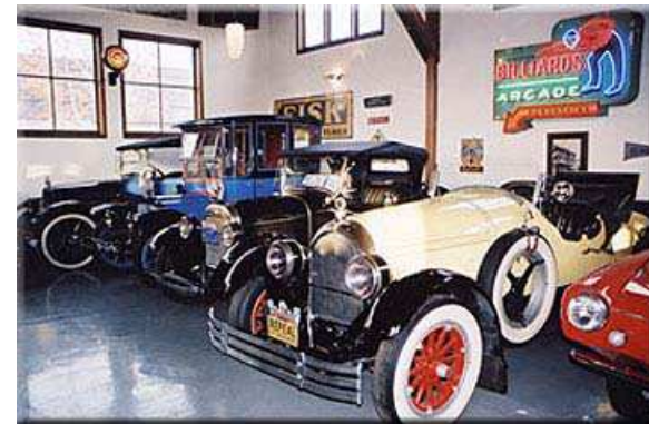
A 1925 Gold Bug on display at the Collectors Museum, San Rafael