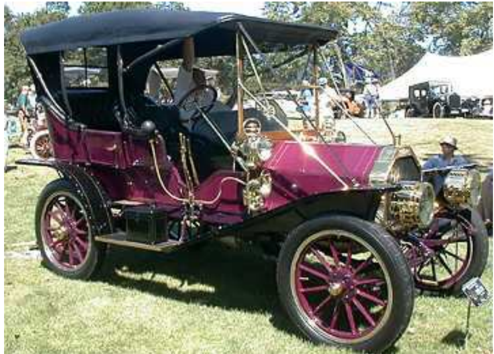
1908 Kissel Kar Model II Touring