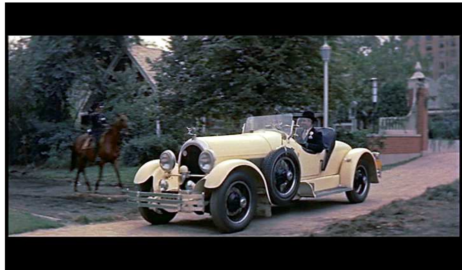
Tyrone Power driving a Kissel Gold Bug In the movie “The Eddy Duchin Story” (1956)