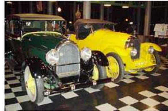
A Gold Bug on display at the Wisconsin Automotive Museum, Hartford