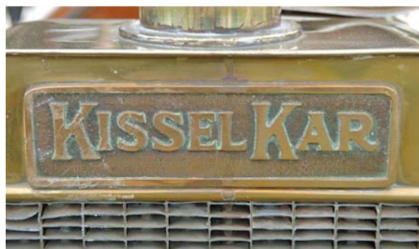
Photo 1. KisselKar plate (1908-1910) as seen on a 1909 Kissel 6-60 G-9 Semi Racer at the 2006 Hilton Head Concours d'Elegance.