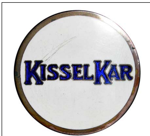
Photo 2. Plain KisselKar emblem (c1910-c1912), as seen on Vic Groah's 1912 Kissel 4-50 Semi Touring.

This (or a similar) emblem is visible on a photo of the KisselKar that drove President Theodore Roosevelt to dedicate the Roosevelt Dam near Phoenix, AZ, on March 17, 1911 [Duerksen, Kendrick]. I don't know if the car is a 1910 or