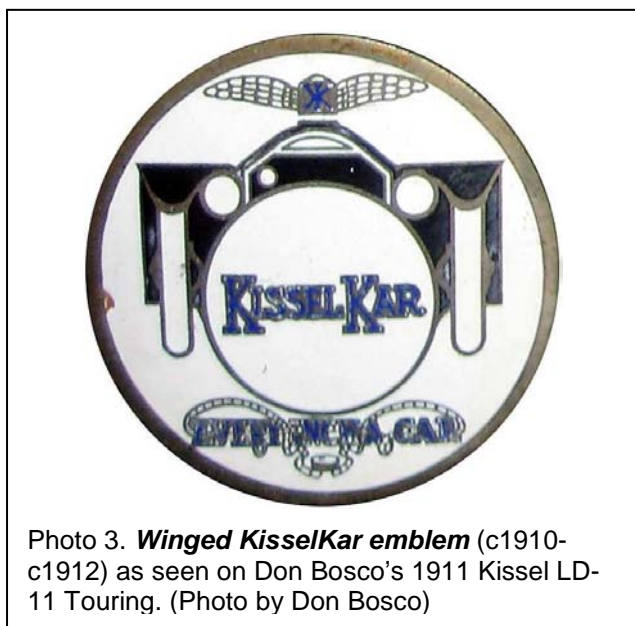
Photo 3. Winged KisselKar emblem (c1910-c1912) as seen on Don Bosco's 1911 Kissel LD-11 Touring.