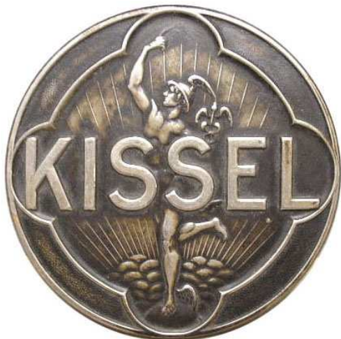
Photo 6. Mercury emblem (1918-1928).