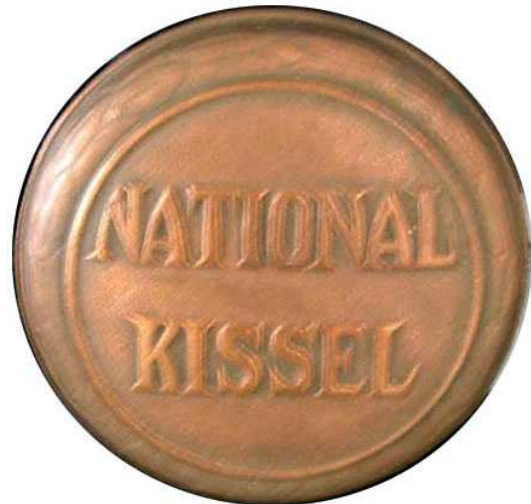
Photo 7. National-Kissel emblem (1928-1929).

After producing a small number of 1931-model-year vehicles, Kissel automobile manufacturing ended on September 19, 1930.